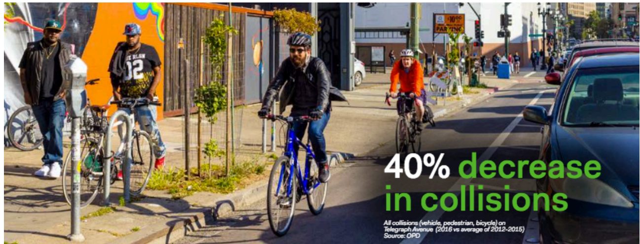
Figure 6 Telegraph Ave. after Reconfiguration (Oakland Department of Transportation, 2017. “Telegraph Avenue Progress Report.” Retrieved from http://www2.oaklandnet.com/oakca1/groups/pwa/documents/report/oak062598.pdf

Telegraph Avenue is a major thoroughfare between Oakland, CA and Berkley, CA that is rated as a high injury corridor. Each direction previously had one vehicle travel lane, one lane with sharrows, and a parking lane. In April of 2016, Oakland reconfigured Telegraph Avenue by removing a travel lane in each direction to create nine blocks of parking-protected bike lanes and added eight high visibility crosswalks. The progress report on Telegraph Avenue, released in January 2017, showed a 40% decrease in all collisions between various users. The median vehicle speeds since the re-configuration are now closer to the posted speed limit, without an increase in travel times. Since adding the protected bike lanes, there has been a 78% increase in people biking and people walking increased by 100%. The increased bike and pedestrian traffic has also contributed to a nine percent increase in business along the corridor.