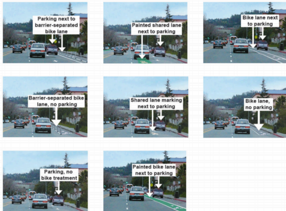
Figure 4: Bike Lane Treatments that Survey Users Rated According to Comfort Level (Sanders, R.L., 2014. "Roadway Design Preferences Among Drivers and Bicyclists in The Bay Area.")

A doctoral student at UC Berkley asked drivers and people biking in the San Francisco Bay Area to look at eight different roadway configurations with different types of bicycle lane treatments. The survey illustrated examples of bike lanes with no separation from traffic (sharrows), bike lanes with a painted separation (Class II bike lane), and bike lanes that provided a physical barrier from vehicle traffic (Class IV protected bike lane). People driving and biking rated which treatment they felt most comfortable on while driving near bicyclists or bicycling near traffic. The survey results showed that both