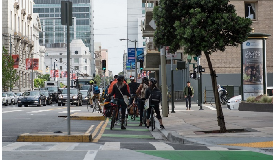
Figure 8: Protected Bike Lane on Polk St. & Hayes St. in San Francisco ( San Francisco Municipal Transportation Industry, 2017. “Pedal Out for Bike to Work Day This Thursday”)

Adding protected bike lanes on El Camino Real is expected to increase the usage of active transportation methods and in turn reduce obesity and diabetes rates, and limit harmful emissions in our environment. 15,16 Researchers examined data from community health surveys representing people from all 50 states and at least 47 major cities. They found that people who bike to work have a better chance at achieving the recommended physical activity level, a lower obesity rate, and a lower rate of diabetes. These statistically significant results were found to be consistent between international, state, and city populations. Other health benefits can result from environmental improvements as well. When more people are walking or biking there are fewer cars on the road, leading to a decrease in harmful emission particles. 17 Protected bike lanes on El Camino Real can lead to more people biking and walking, leading to decreases in obesity and diabetes, and improved air quality; all resulting in measureable health benefits for our region.