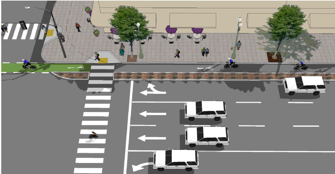
Figure 1 Concept of Protected Bike Lanes on El Camino Real in Redwood City (City of Redwood City, 2017. “El Camino Real Corridor Plan. CAG meeting #3” http://www.redwoodcity.org/home/showdocument?id=10199 )

In the last couple of decades of transportation and urban planning, there has been a shift in engineering design away from auto-centric thinking. 1,2 Many regions in the United States are trying to place an emphasis on incorporating multi-modal transportation options in their communities, referred to as a Complete Street design. 3 The Grand Boulevard Initiative is a collaboration of cities that El Camino Real passes through on the San Francisco Peninsula, from Daly City to San José, CA. Using urban planning strategies, the goal is to transform the corridor along El Camino Real: away from an auto-centric thoroughfare, and into a more livable community for all.