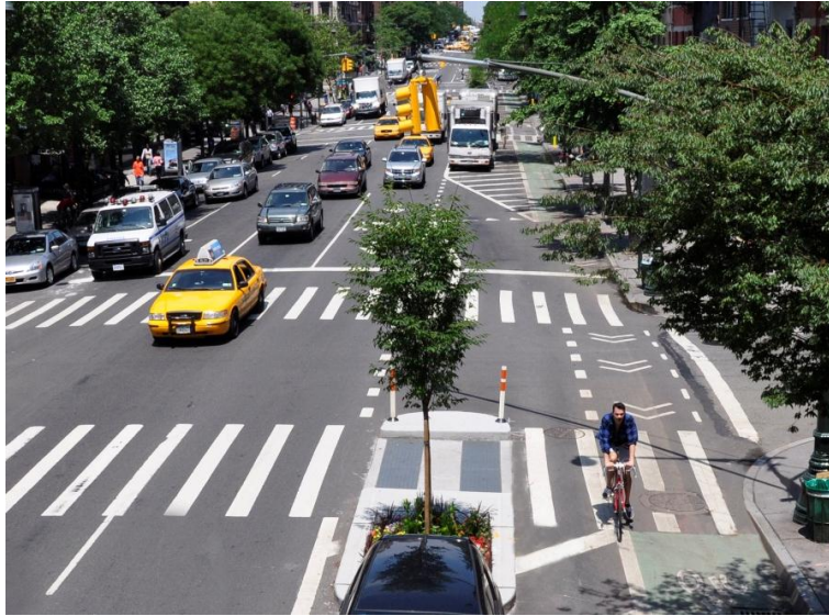
Figure 7: Parking Protected Bike Lanes in NYC (New York City Department of Transportation, 2014. “Protected Bike Lanes in NYC”)

At the end of 2014, New York City announced that it had added over 30 miles of protected bike lanes to city streets since 2007. The New York City Department of Transportation examined data from 12 projects that were three years or older and found that the total injuries for all users dropped by 20%. Columbus Avenue, a one-way street, had three travel lanes, a mixed rush hour/parking lane, and a parking lane. The width of existing lanes for a mile-long section of Columbus Avenue was decreased to add a parking-protected bikeway. Data collected for the report showed a 26% decrease in injury crashes while people biking increased by 51% and travel times were reduced by 35%. The other protected bike lane projects in New York City saw a similar trend in reducing collisions, while the number of people biking increased. The data from New York City suggests that adding protected bikeways on El Camino Real would decrease the likelihood of collisions even with an increased number of people biking.