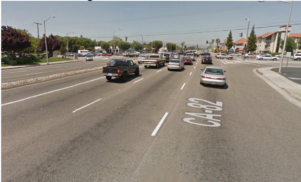
Figure 2 Current Conditions on El Camino Real in Santa Clara (Silicon Valley Bicycle Coalition, “Bikes on El Camino Real”)

Historically, El Camino Real was a 600-mile stagecoach path that connected the Franciscan missions between San Diego and Sonoma. El Camino Real parallels the first commuter rail service west of the Mississippi and the first road to have sections paved for the California State highway system. El Camino Real is the only non-freeway road that connects from Daly City to San José, and is the backbone of the historical communities on the Peninsula. This, as well as the concentration of housing and businesses along this corridor, makes it THE essential North-South route, not only for motor vehicles (its main use today), but for bicyclists and pedestrians as well. Parallel routes for people biking exist in some of the various cities along El Camino Real, yet these are disconnected and not always well publicized.