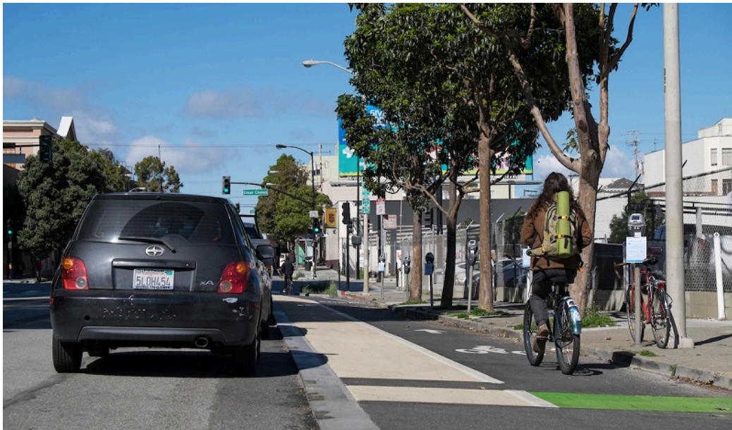
Figure 5: SF’s First Parking Protected, Raised Bike Lane on Valencia Street ( San Francisco Municipal Transit Agency, "Happy Bike to Work Day..." https://www.sfmta.com/about-sfmta/blog/happy-bike-work-day-new-protected-bike-lanes-and-bike-count-webpage )

Despite common opposition, adding bicycle facilities does not significantly impact travel time or local businesses. Beginning in 1999, San Francisco began to transform a retail-oriented portion of Valencia Street by removing a travel lane from a four-lane street. This allowed the city to add bike lanes to the re-configured two-lane road with a center turn lane. A year after completing these changes, it was noted that bicycle usage increased by 140% during the peak period of the afternoon while travel time for people driving was not significantly affected. San Francisco has continued to make changes along Valencia Street throughout the years to widen sidewalks, add pedestrian friendly lighting, bulb-outs for pedestrian crossings, and optimized traffic signals. San Francisco businesses along the re-configured portion of Valencia Street reported seeing an increase in sales of 60%, in part, due to the increased number of people walking and biking. Like the Valencia Street project and others from around the country, adding protected bike lanes on El Camino Real could produce similar trends of increased biking, consistent travel times, and increased business.